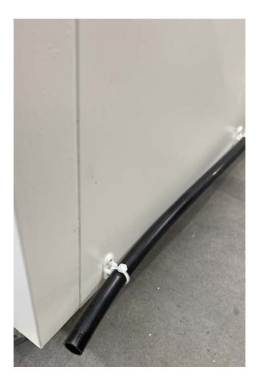
Section 1: Placement

The above picture shows the location on the back of your Climatron cabinet of the drain.