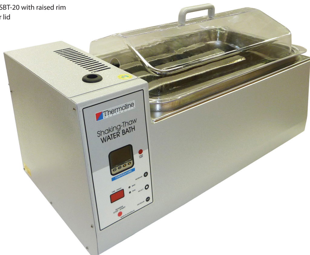
Image: TSBT-20 with raised rim and clear lid