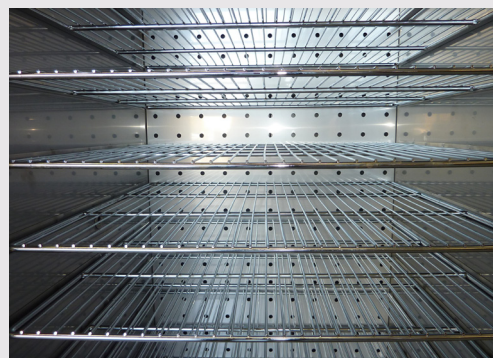
Horizontal air flow system

Head Office Phone (02) 9604 3911 Head Office Fax (02) 9725 1706