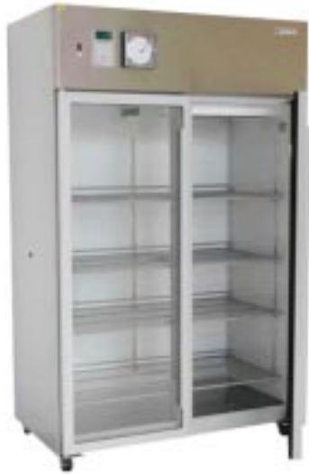
TUF-950-20-2-GD (shown with optional TS-2000 alarm system and recorder)

* Shown with optional TCR-115 and TS-2000