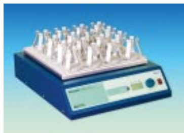
SHO-1D (Shown with optional flask tray)

This digital orbital shaker is ideal for general applications where smooth mixing or intensive mixing is required. One platform size available, 230x230mm, with adjustable speed control by turn dial. This model has a LCD display which indicates timer duration, current RPM and a power bar graph. Audible alarms to notify the user in the event of an error or timer end. Shaker supplied with rubber mat or drilled platform. Flask trays are optional extra (see next page)