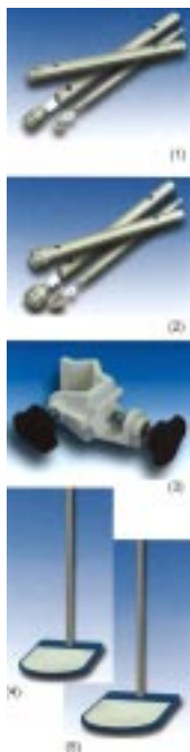
Dispersing Tools, clamp and stands.